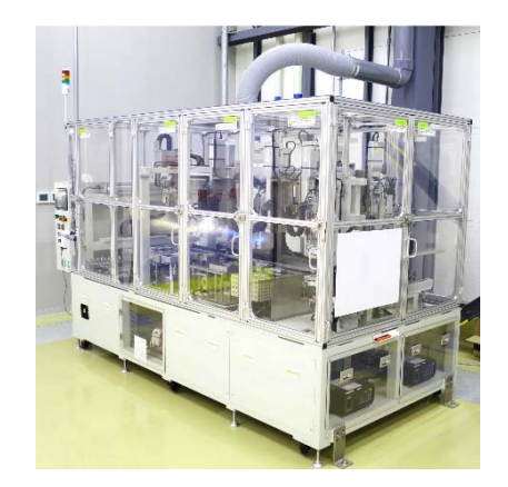
One-piece-flow automatic-sliding plating machine