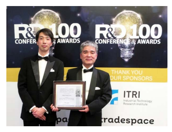
R&D 100 Awards ceremony participants

Electroplating is a process that puts the target item into contact with a plating solution via an electrode, without requiring a plating bath, enabling just the contact surface to be plated while sliding by the electrode.