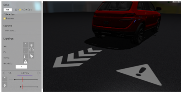
Tools for developing and evaluating new indicator system

The new system includes a development and evaluation tool that manufacturers can use to check illumination patterns before installing the system in vehicles.