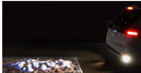
Animated illuminations projected on road surfaces are highly visible even in bad weather