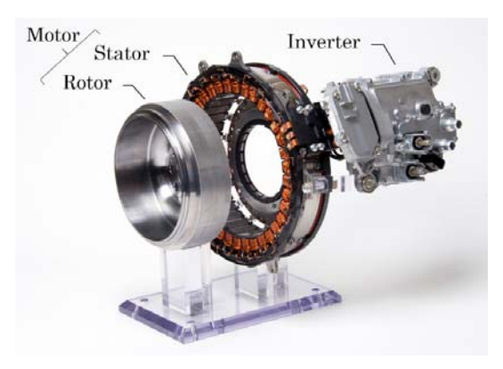
Crankshaft ISG system for 48V hybrid

The demand for 48V hybrid vehicles, which offer excellent fuel efficiency at relatively affordable costs, is expected to increase, especially in Europe. Mitsubishi Electric developed its ISG system—a crankshaft direct-driven system for idling-stop-start, energy recovery and torque assist—to achieve higher output power and better fuel efficiency in 48V hybrid vehicles. Mitsubishi Electric will continue developing increasingly smaller, lighter-weight and higher-power ISG systems to increase fuel efficiency and reduce CO<sub>2</sub> emissions.