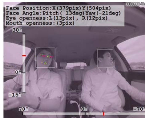
Monitoring both driver and front passenger

Conventional driver-monitoring systems generally use a camera to analyze the driver's face for inattentiveness or drowsiness. Recent imaging systems monitor not only the driver but also the front passenger for added safety and convenience. Mitsubishi Electric has now developed a technology that uses just one wide-angle camera to monitor both the driver and the front passenger and warn them about potentially dangerous driving behavior, such as looking off to the side or sleepiness, and to identify face and hand gestures for enhanced assistance, such as changing air conditioning settings.